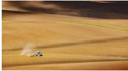
Tractor in a Ukrainian field

Ukraine is the wheat's grain of the West. Russia and China are competitors for the United States and especially finance, which wants to divide and conquer.