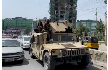
Taliban convoy in 2021

NATO makes war in Afghanistan to destabilize China. The NGOs created there grab the money provided for Afghan people. However, the Taliban, an ethnic group united with Afghan people by same religion, will always have fought against drugs. NATO is installing poppy cultivation in the country.